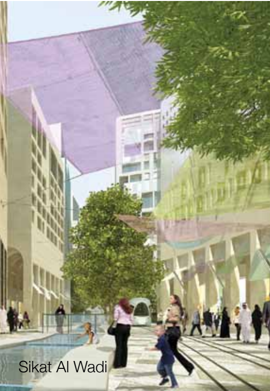
Sikat Al Wadi