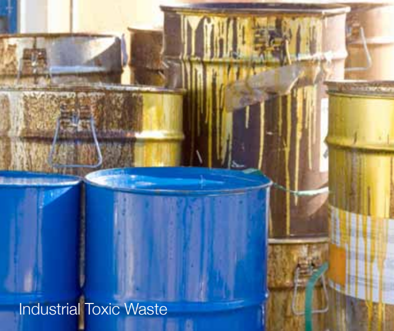
Industrial Toxic Waste